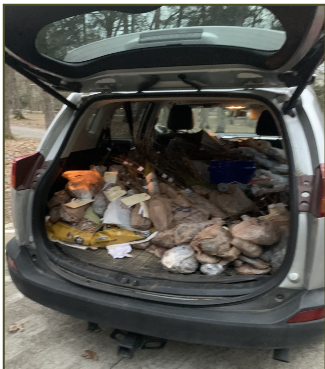
Tree Day saplings all ready to be given away!

This newsletter supports the Tennessee Extension Master Garden Program in providing research-based, innovative and usable horticulture information to all Tennessee residents through a dedicated and skilled volunteer network.