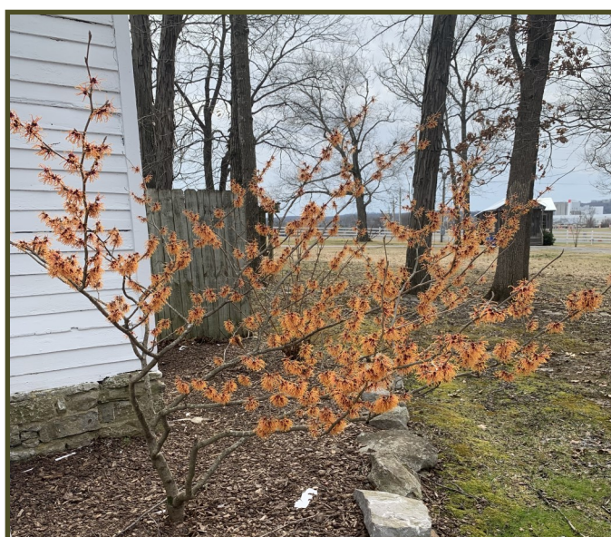
Witchhazel blooming at Melrose Church.