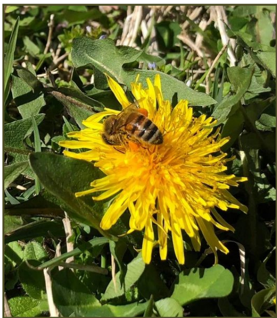
Bees need these early spring flowers so don't think they are just weeds. Be kind to bees, we can't survive without them.