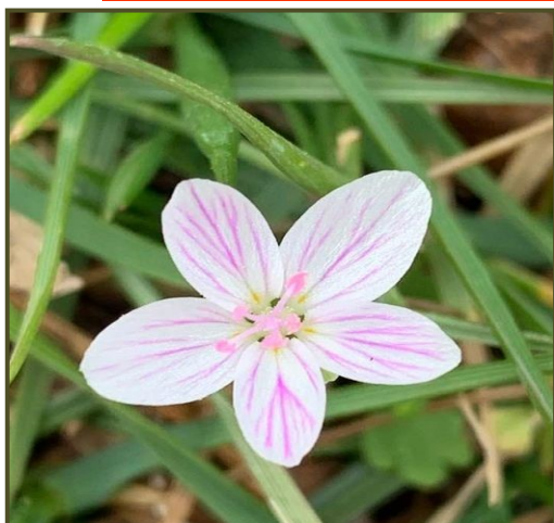
Virginia Springbeauty.