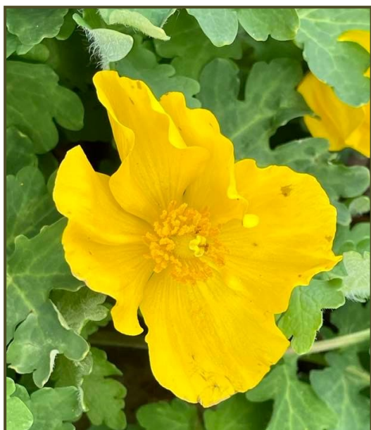
Celandine poppies blooming at the Butterfly Garden.