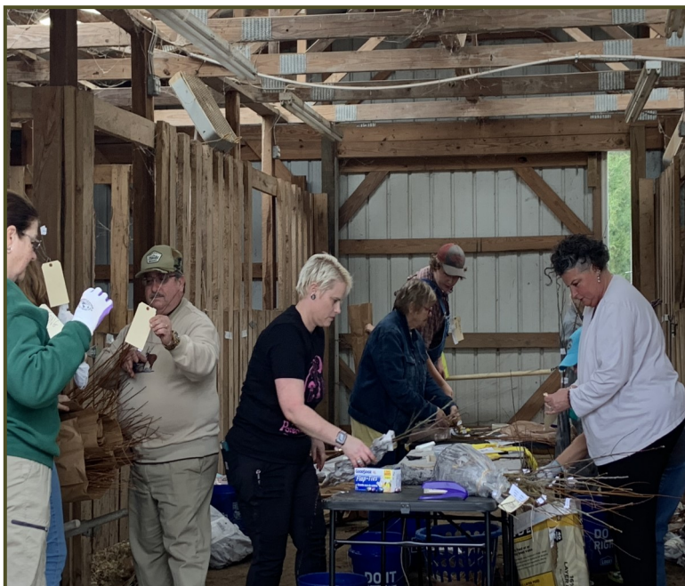
Tennessee Tree Day volunteers busy putting tree orders together.