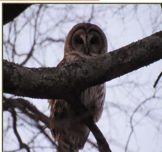
Who's looking at you!